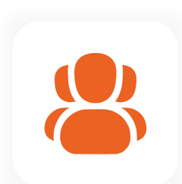
Participating in class