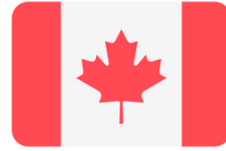
Canada public librairies