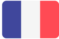
France schools and public librairies