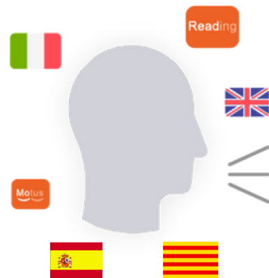
For more accessibility: morpheme coloring, independent control of fluency, ...