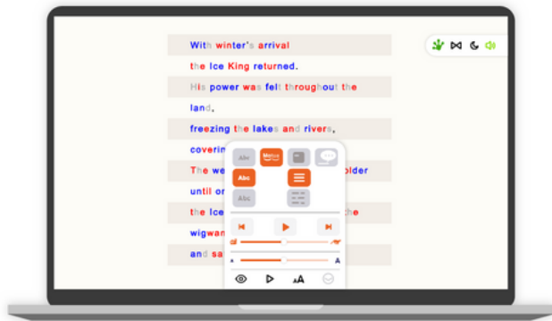
An offer from 1st to 12th grade with FROG literature and textbooks